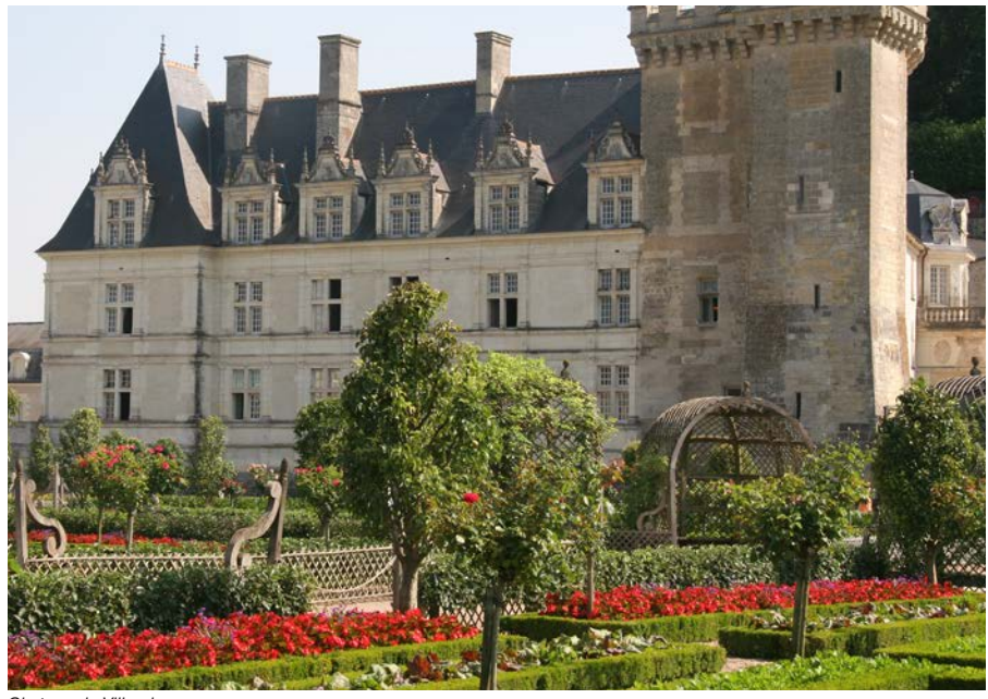
Chateau de Villandry