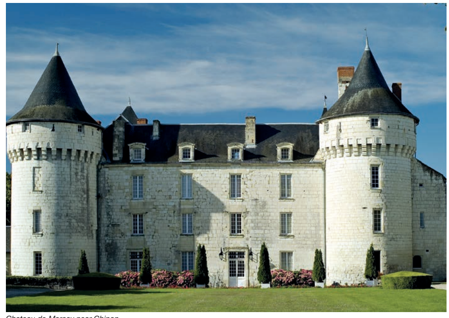
Chateau de Marcay near Chinon

Just a short distance from the banks of the