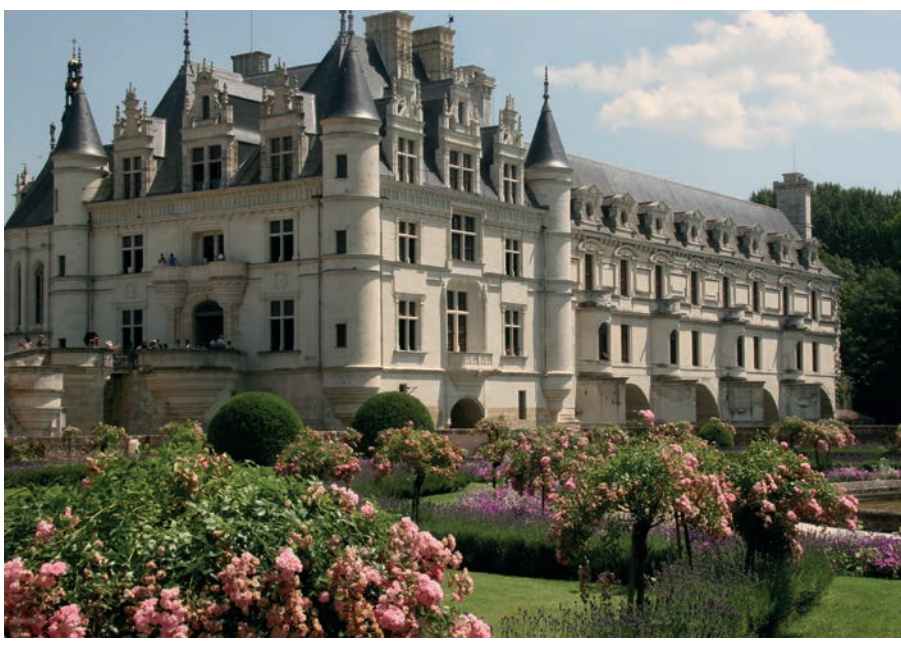
Chateau de Chenonceau